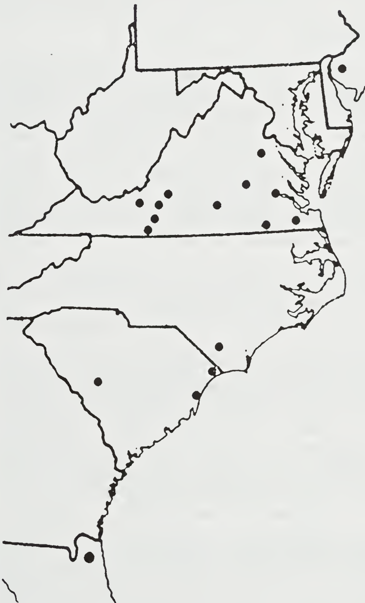
Figure 2. Central Atlantic states, showing all known localities for Holcocranum saturejae .